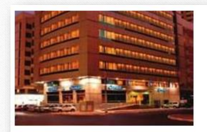
Crystal Hotel - Al Salam