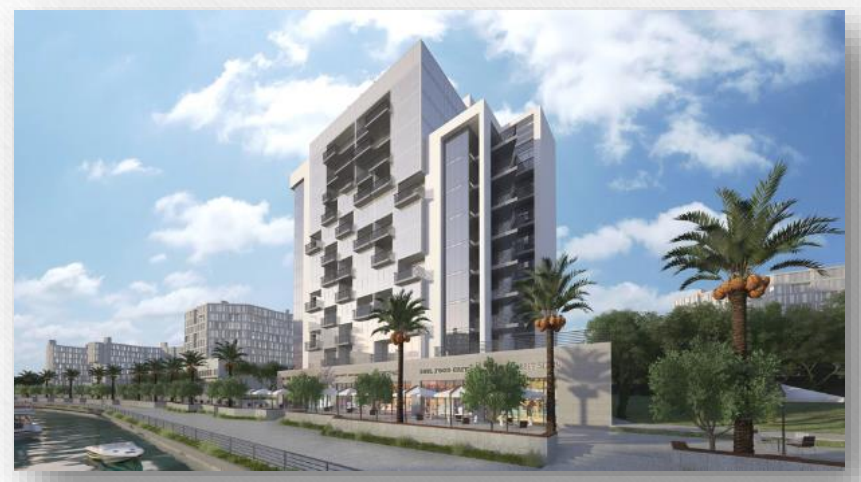
Al Raha Beach