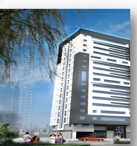
Commercial & Residential Bldg. - CRC